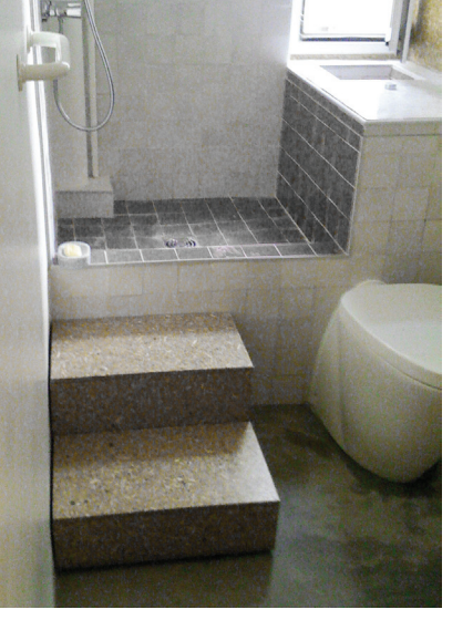
Bathroom of Madame Méziat, the steps / storage units, the shower and the enclosed flushing system Paris. France (75)