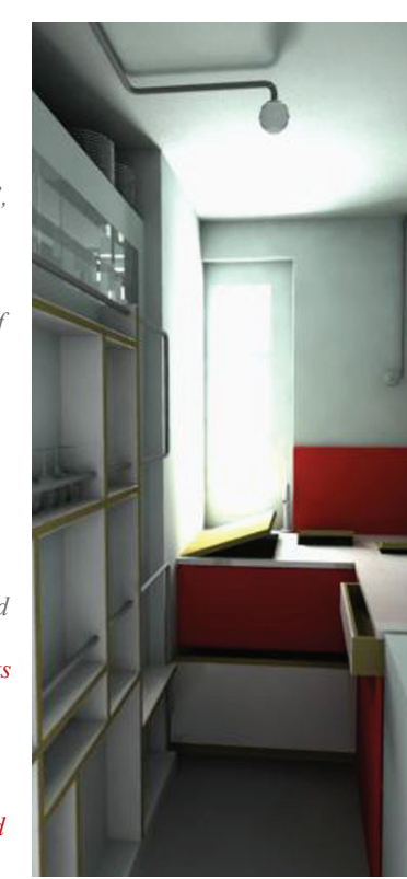
3D simulation of the kitchen before construction Paris, France (75)

Founding the logic of this architecture on the tensions between the intimate and the interior, between taste and distaste, between Apollonian nudity and Dionysian formlessness, opened up possibilities of finding economic solutions on the site and imagining uses that had not existed before, whereas a purely accounting-based logic would not have led to such finds.