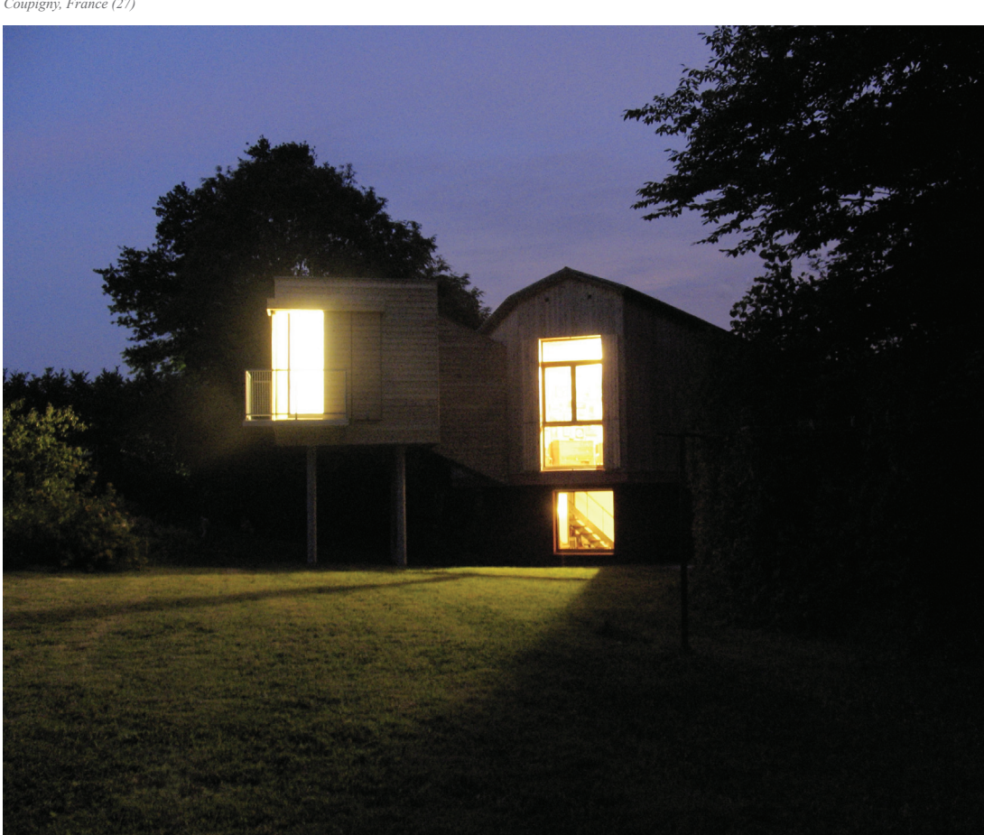
Night view of the bathroom - Photography credit: Stephane Thidet Coupigny, France (27)