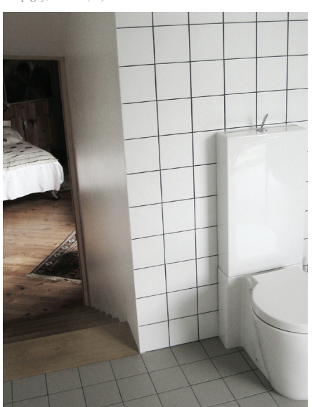
View of the bedroom from the bathroom Coupigny, France (27)