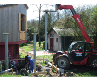
Delivery of the columns The drying foundation The installation of the columns Coupigny, France (27)