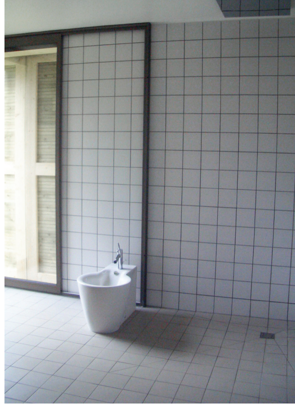
The shower Coupigny, France (27)