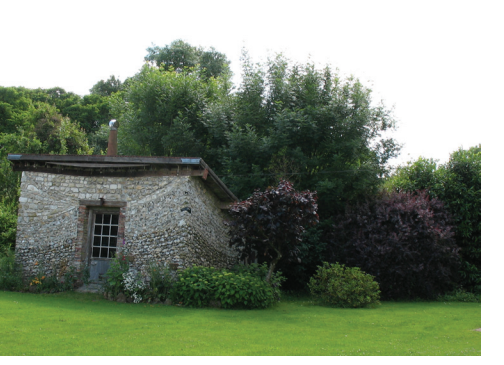
The painting workshop Coupigny, France (27)