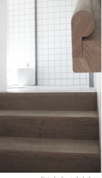
Stairs leading to the bathroom Coupigny, France (27)