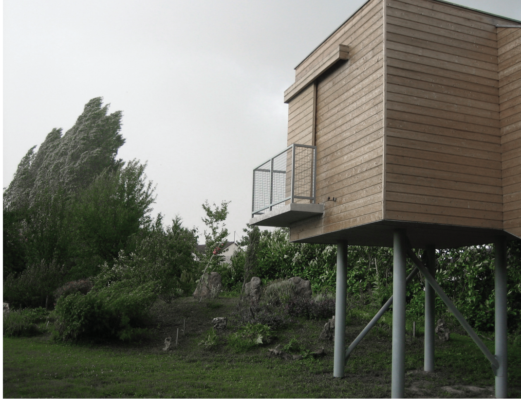
View of the bathroom from the garden Coupigny, France (27)

the history of art. Their territory was in counterpoint to the teaching at the school of architecture: no plans, no companies, buildings constructed exclusively from recycled materials, no grounding in the history of architecture... and yet, these buildings were endlessly fascinating and directly questioned the act of inhabiting the world. When faced with this territory built outside of Architecture, certain questions became impossible to ignore. Here, architecture appeared to me as one system of producing buildings among others, it no longer belonged to architects. In addition, the practice of architects appeared regulated, governed by an internal logic of great permanence. As I could not pretend to have not myself inherited this architect's view on Architecture, the rationale for this first project lay in the attempt to embrace the intimate attraction of